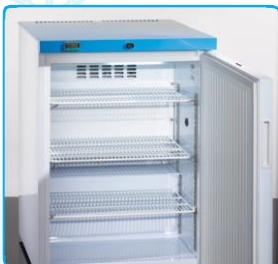
Fully Adjustable shelves