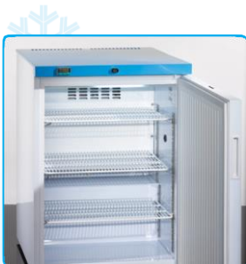
Fully Adjustable shelves

This model is also available with a glass door, please see Labcold model RLCG0502.