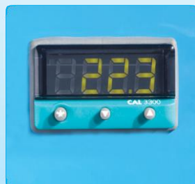
Digital Microprocessor Controller